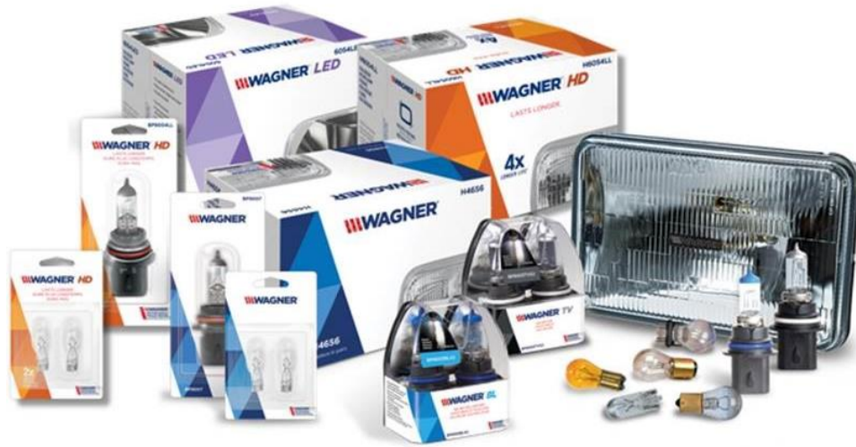
Forward Lighting, Miniature Bulbs, Sealed Beams