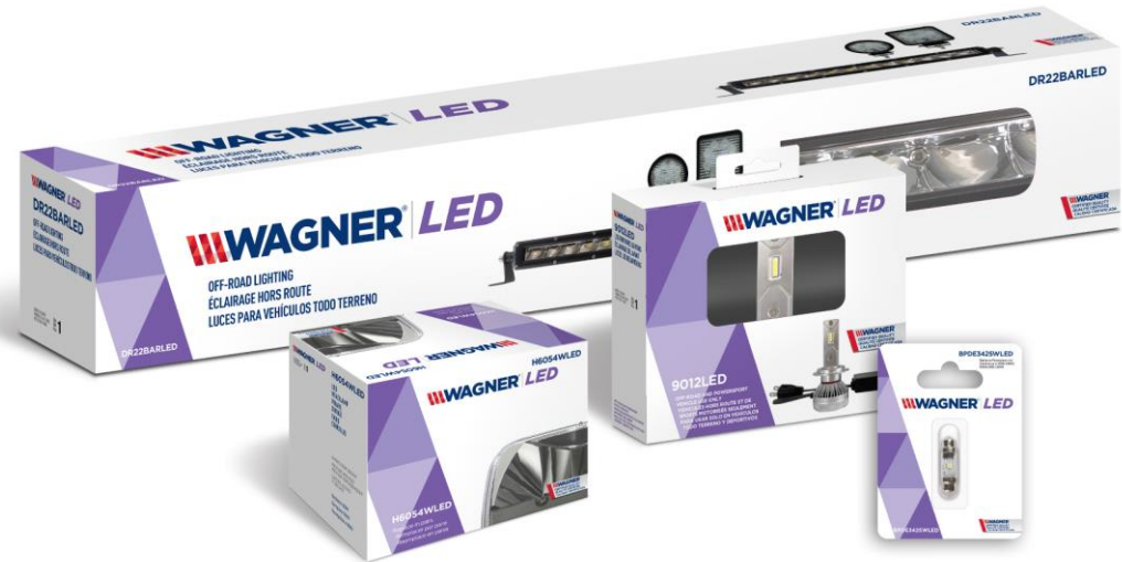
LED Lighting Expansion Coming November 2024